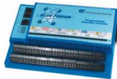
Blue Fusion Model 5200

Hopkinton, Mass.-based Control Technology Corporation (www.ctc-control.com) has added the Model 5200 to its Blue Fusion™ line of web enabled automation controllers. The Model 5200 features a built-in web server, enabling users to securely monitor, control and upgrade processes via Internet access. The unit also includes multi-unit expansion racks to allow users to control larger applications with more I/O with a single CPU and control strategy. A single Blue Fusion system can now