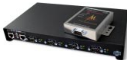
DeviceMaster UP Gateway

In this environment, a device such as a high-speed servo or encoder sends out status data continuously. The string filtering option filters out duplicate status data so the PLC only receives the status data when it changes.